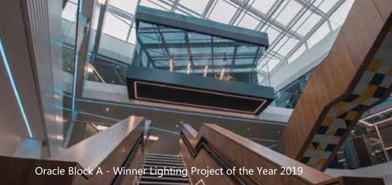
Oracle Block A - Winner Lighting Project of the Year 2019