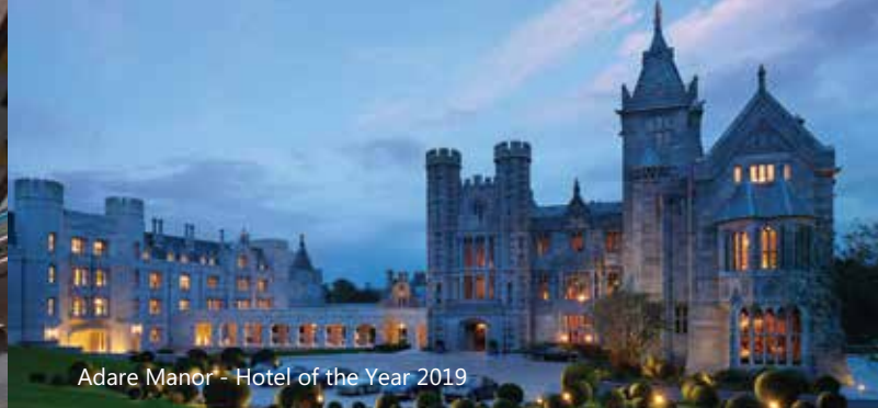
Adare Manor - Hotel of the Year 2019