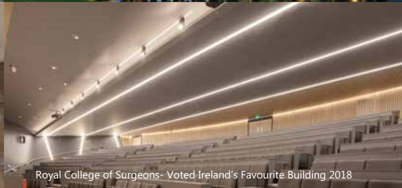
Royal College of Surgeons- Voted Ireland's Favourite Building 2018