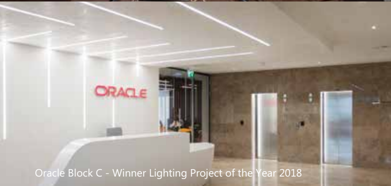
Oracle Block C - Winner Lighting Project of the Year 2018